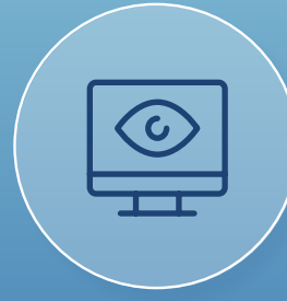
SECURITY AWARENESS TRAINING